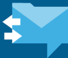
FILE BACKUP & COLLABORATION