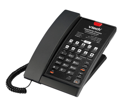
CTM-S2212 (Matte Black)