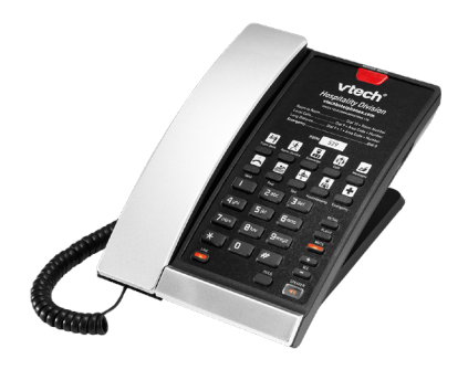
CTM-S2212 (Silver & Black)